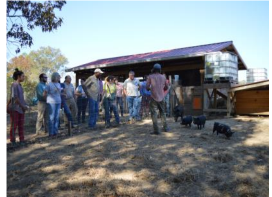
From ASAN's 2016 Regional Food & Farm Forum at Camp McDowell in Nauvoo

The overall goal of the FNA is to gain a more textured understanding of what your goals and visions are as a producer, what your operations currently